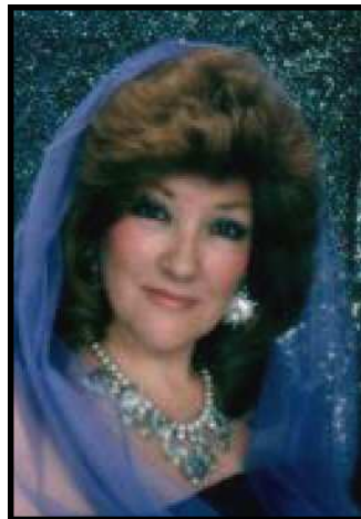
1998 Promo Photo

This is one of the more recent pictures of me at work taken in August of 2005 while reading at Pagan Pride Day